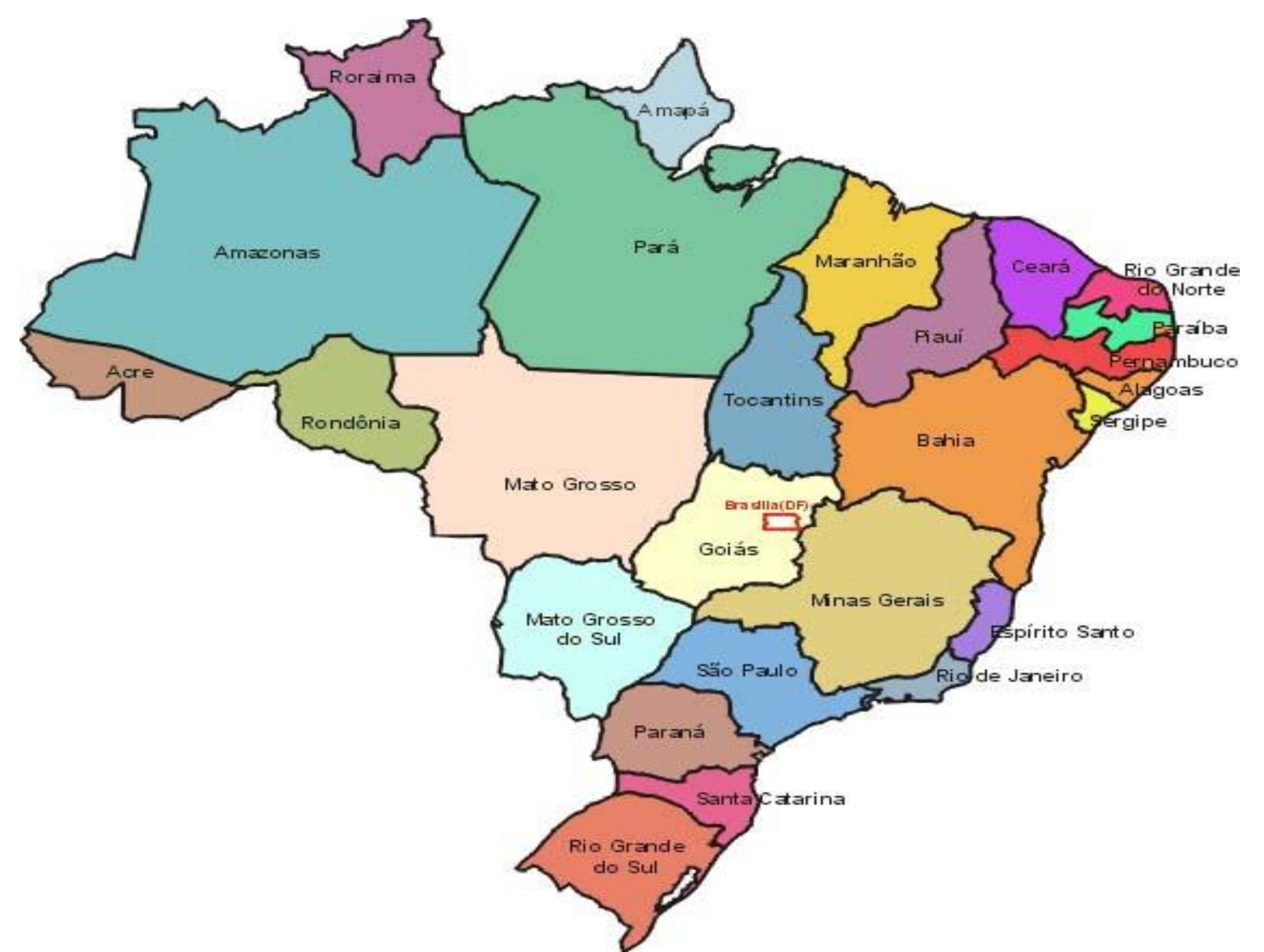
Fig 2.Map of Brazil.