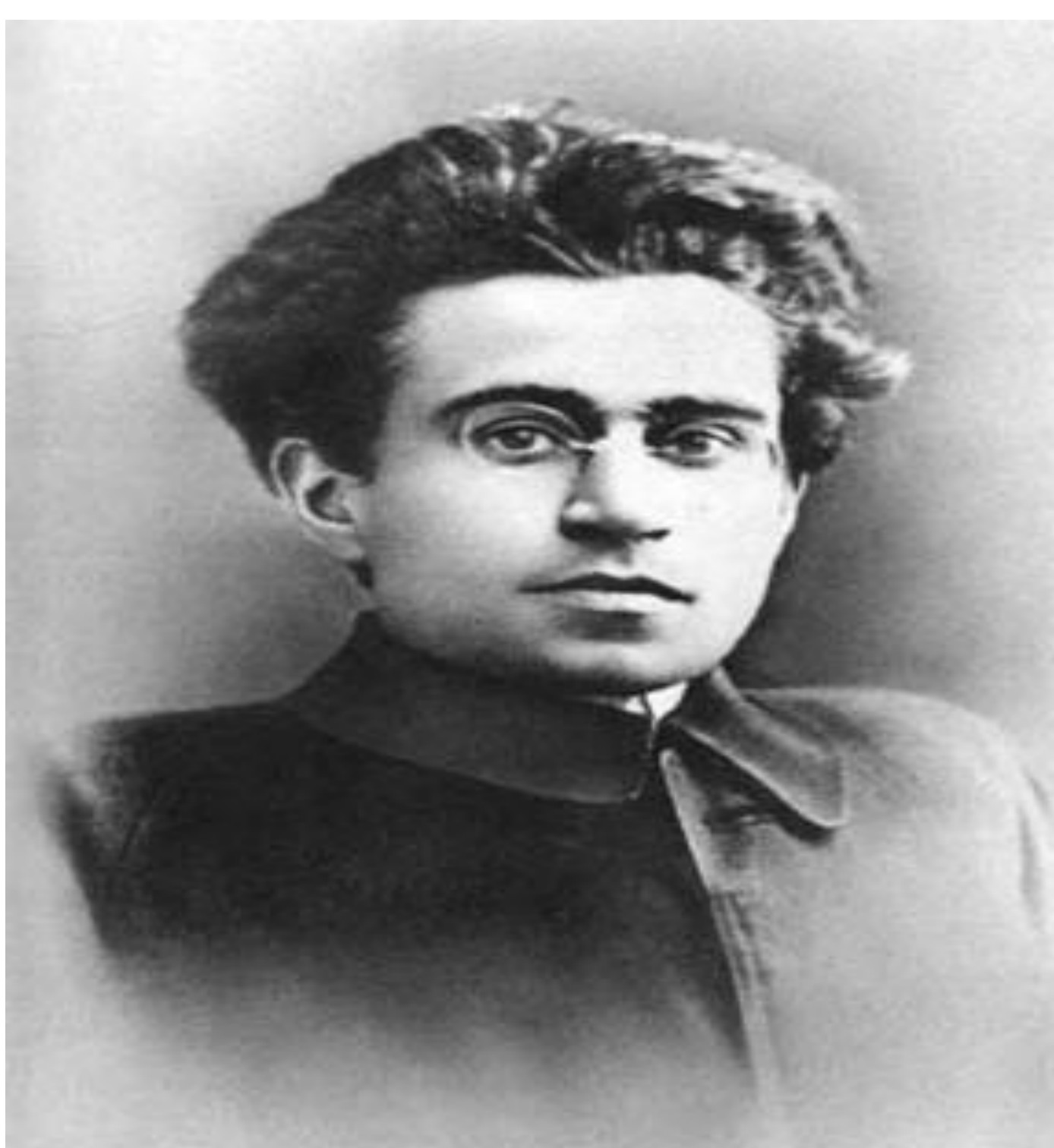
Fig 1...Antonio Gramsci (1891-1937)